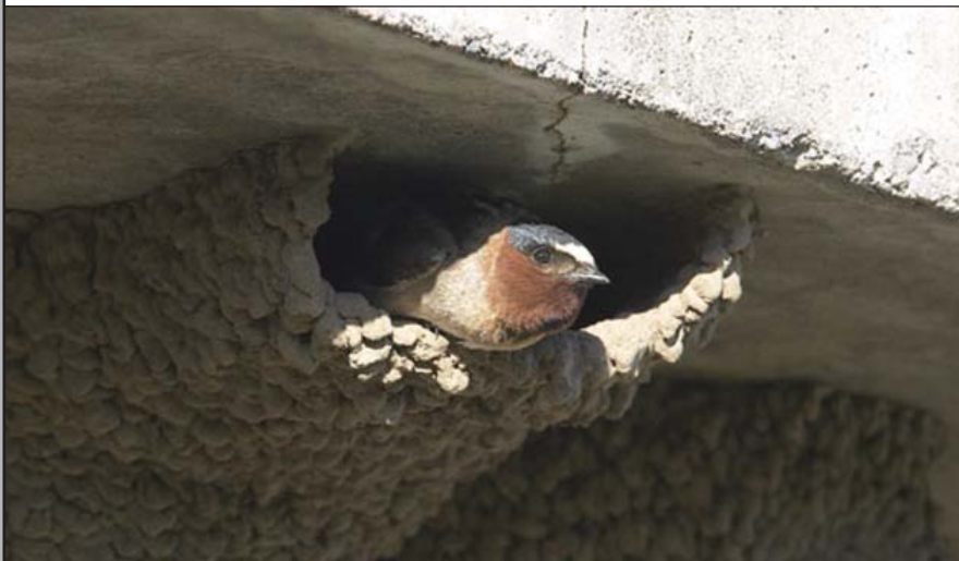
Messy business but someone has to swallow it

To TxDOT, the swallows and their mud nests were a tricky problem. In no way did they want to harm the creatures, nor make their living spaces in culverts and bridges "uninhabitable to [these] beneficial, insect-eating critters. We [did], however, want to restrict their use of these structures prior to and during the demolition of the structures in order to keep [our projects] on schedule." In addition, they didn't want to prevent the return of the swallows to the new culverts